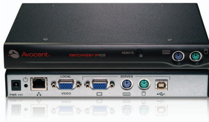
The SwitchView IP remote access device provides BIOS-level access and control to your existing KVM switch, all over a browser.

The simple and compact design allows for ease of installation using standard TCP/IP connectivity. With no software agents needed, configuration and installation are simplified on the target servers. The SwitchView IP 1020 remote access device supports 1600x1200 resolution for the local user and 1280x1024 for the remote user. This solution is an economical remote IP solution for accessing your servers with each switch.